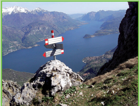
Ascent to Monte Grona

From Rifugio Menaggio you can reach the top of Monte Grona (1736 m) from where one can admire one of the best views of the Pre-Alps; apart from the three